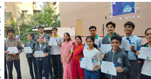
Kabirites as Facilitators

The event showcased the school's commitment to digital literacy, and students from Raneshwar School received certificates for their participation in a digital literacy workshop, highlighting collaboration and learning.