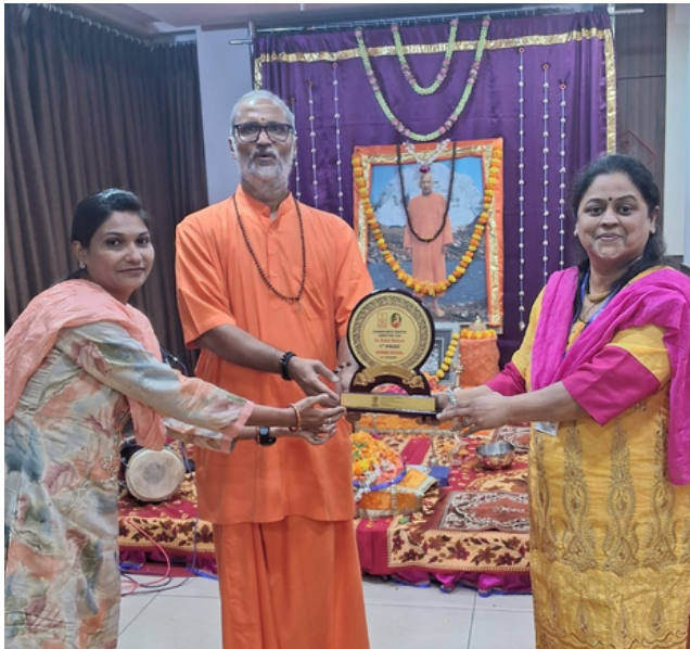
Best School Award